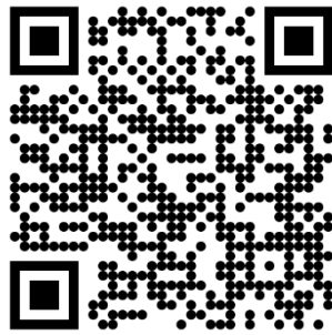
Terms & Conditions

Mazda Connected Services Privacy Policy outlines Mazda's practices with respect to the collection, use, communication and other processing of your personal information, including, as applicable, for limited features certain of your biometric information. The Mazda Connected Services Terms of Use and Privacy Policy are available by scanning the QR code below